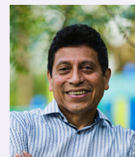
Celso Mesias Commissioner