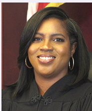
Timika Lane PA Superior Court